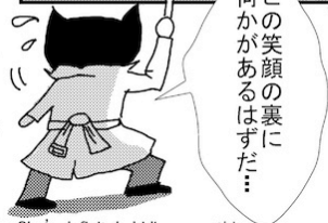
She's definitely hiding something behind that sweet smile!